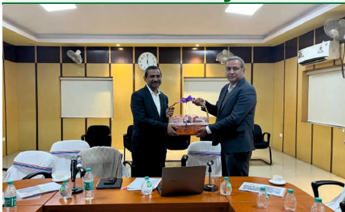
The Secretary interacted with cadres, reviewed rural development schemes and was satisfied with the progress.