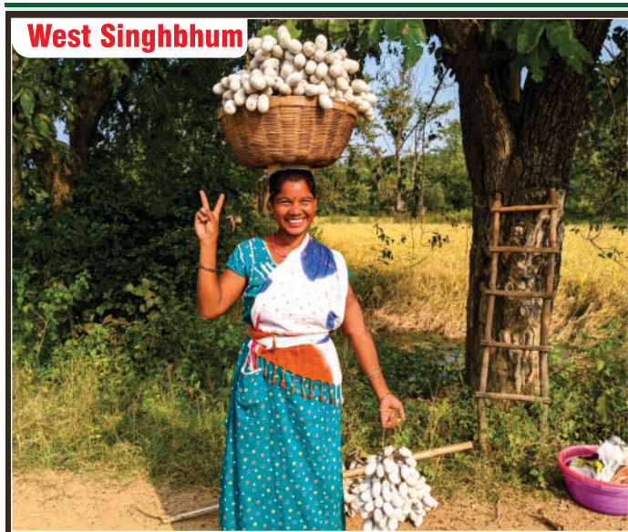
The Mahila Kisan Sashaktikaran Pariyojana is an initiative to enhance the income of women farmers.