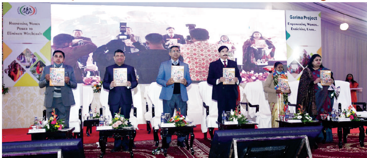
The goals of the Garima Project revisited and consolidated action plan discussed

JSLPS is working hard to eradicate witchcraft from 7 districts of the State through Garima Project. The project aims to establish a civilized society and provide a dignified life to every woman by eliminating social evils like witchcraft through the economic and social development of the women in the areas affected by these evil practices.